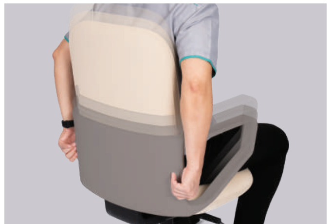
Easy glide backrest and armrest height adjustment.