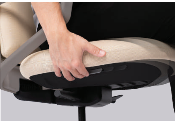
50mm seat depth adjustment.

Standard N2 base is moulded of polypropylene plastic (100% recyclable) in black colour.